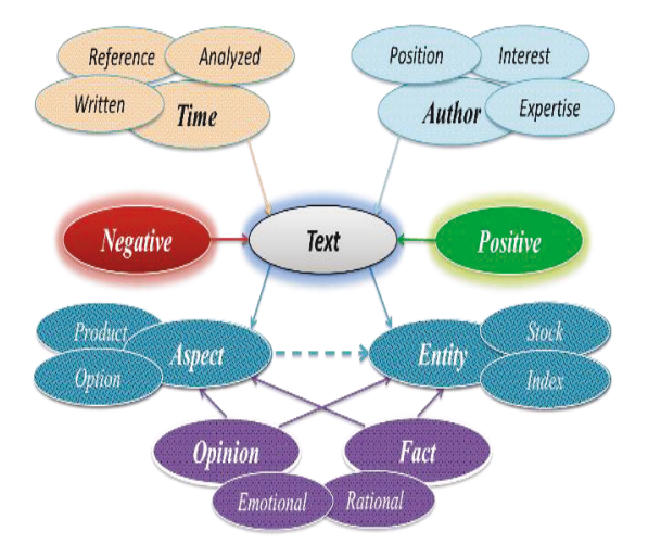
Fig. 1. The complexity of identifying sentiment in financial messages

Determining the sentiment in a given text on financial securities requires far more than merely identifying whether the words used in the text have generally positive or negative connotations. As presented in Figure 1, many different elements should be considered before one classifies a text as being positive or negative. First, the author of a given text should be identified, as the position of the author may have a critical effect on determining the sentiment orientation. A positive sentiment for an investor holding a short position in a given company is a negative sentiment for the company and vice versa. Questions can also